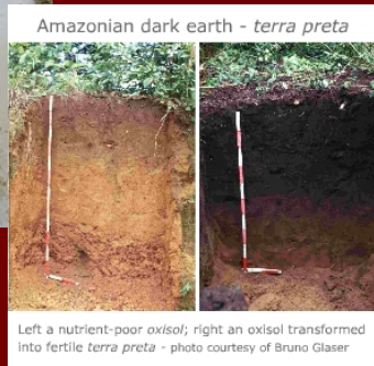
Amazonian dark earth - terra preta