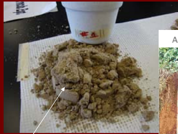
Norfolk loamy sand without biochar