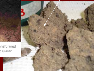
Norfolk loamy sand treated with poultry litter biochar